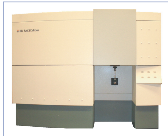
ABOVE: Becton Dickinson FACSCalibur™ Flow Cytometer.